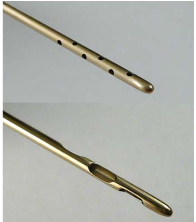
Figures 4a & 4b. a. Close up of Multiport Infiltrator Cannula. b. Close up of 3 Port Carraway Harvester Cannula.

Harvesting Cannulas are designed to actually remove the adipose tissues from the subdermal plane, following the same pattern and location of local anesthesia distribution. It is recommended that Prolotherapists use one of two diameters, smaller for thinner and lower percent body fat patients, and larger for the majority of patients. The openings are offset, meaning in a non-linear pattern near the tip of the cannula. These are in diameters of 1.67 mm and 2.1 mm (OD), and a length of 8 cm. Use of a slightly shorter harvesting cannula versus infiltrator, makes it easier to remain within the local anesthesia distribution areas.