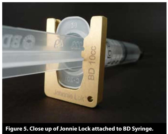
Figure 5. Close up of Jonnie Lock attached to BD Syringe.

Tulip Syringe Locks are designed for use on BD or Monoject 10/12 and 20 cc luer-lok syringes to hold the syringe plunger in a fully drawn position during the application of vacuum. (See Figure 5.) When in the locked position, and all air removed from the system, this permits the physician to apply even and gentle vacuum pressures while moving the cannula through the adipose layer.