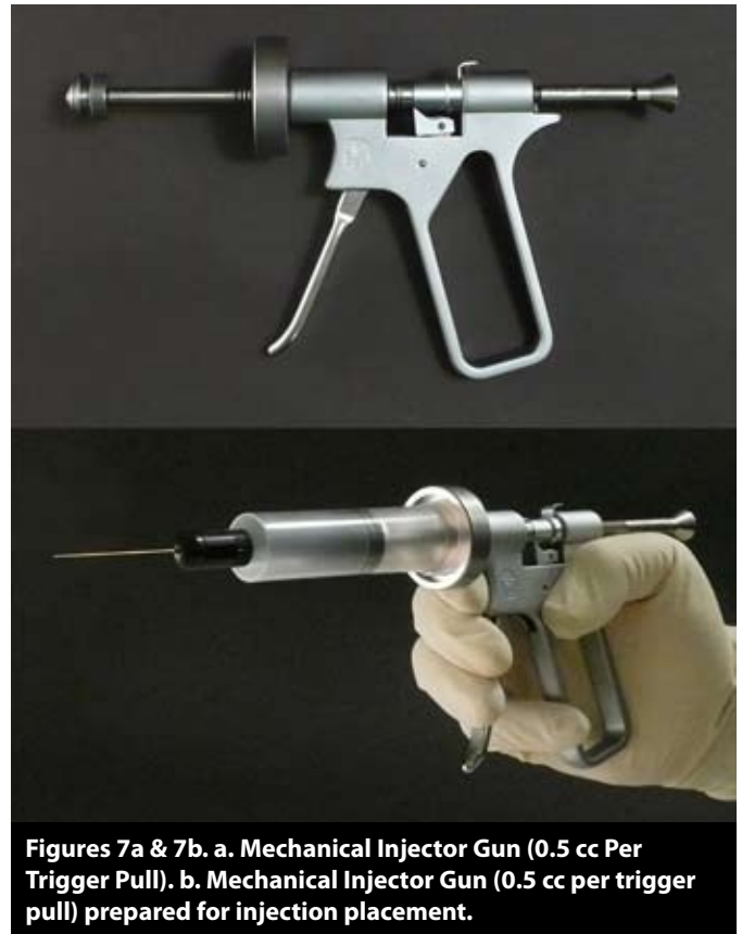
Figures 7a & 7b. a. Mechanical Injector Gun (0.5 cc Per Trigger Pull). b. Mechanical Injector Gun (0.5 cc per trigger pull) prepared for injection placement.

Tulip Injector Gun is a device for placement of controlled 0.5 cc aliquots of treatment mix. When AFG is added to the PRP, the density of the injection material is increased. This may result in the Prolotherapist requiring more force to inject into the tissue site. Single trigger pull provides exact volumes of solution to be placed with less pressure required by the provider. (See Figures 7a & 7b.)