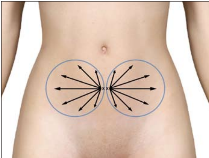
Diagram 1. Marked abdominal skin for infiltration and harvest. X marks skin opening site(s) arrows outline pattern of infiltration of local and harvest.