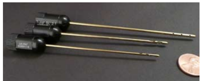
Figure 2. Prolotherapy Microcannula Set (Cell-Friendly).

Left to Right: Anaerobic Transfer (Super Luer Lok); Cell Friendly™ Microcannulas; Mechanical Injector Gun; BD Syringes with Locks In Place.