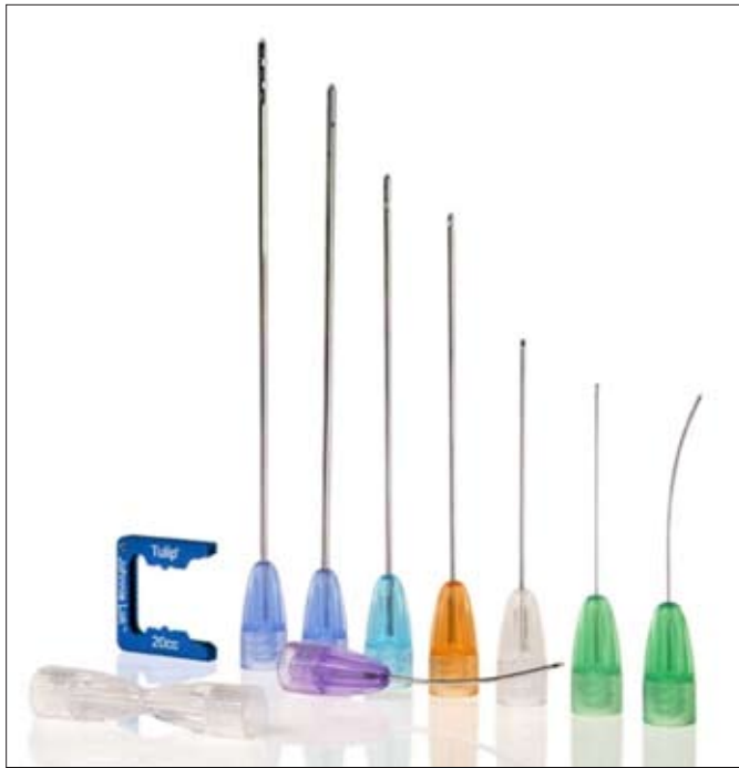
Figure 3. Tulip™ Medical Disposable Microcannula System.