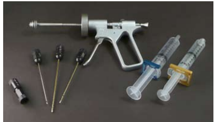
Figure 1. Tulip™ Medical Closed Syringe Microcannula System For Lipoaspiration & Injection.

These cannulas are internally polished by a proprietary extrusion process to maximize internal smoothness